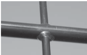
360° welded elements and black powder coating provide maximum durability